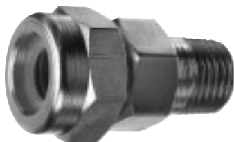
BALL CHECK NOZZLE