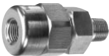
BALL CHECK VALVE